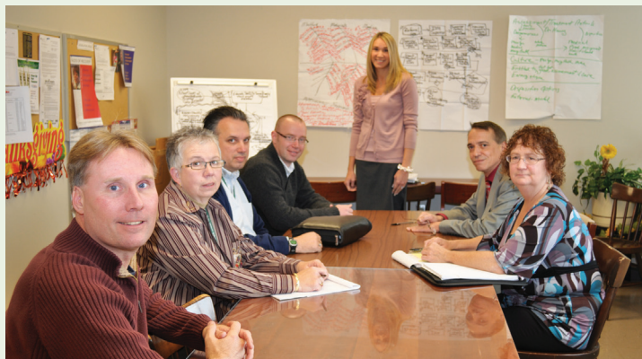
Pictured left are the Heritage Valley Health System Staunton Clinic team members who developed the “Proactive Intervention Project with Bipolar Patients to Reduce Emergency Visits and Hospitalizations.”

There were 98 entries in the 2010 Spirit of Excellence Awards program which spotlights creative and innovative programs that support organizational excellence, patient satisfaction, customer service, employee satisfaction, commitment, and community participation.