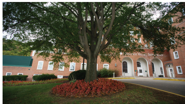
Heritage Valley Sewickley