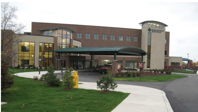
Heritage Valley Beaver

Heritage Valley's strategic focus on customer/patient satisfaction, quality and safety, fiscal responsibility, and market expansion/community health has served it – and the communities it cares for – well. In addition to being named Blue Distinction Centers for Specialty Care ® by Blue Cross and Blue Shield companies, Heritage Valley has received multiple Achievement Awards from the Hospital and Healthsystem Association of Pennsylvania (HAP), been named a Bariatric Surgery Center of Excellence by the American Society for Bariatric Surgery (ASBS), and was the only Western Pennsylvania health system recognized by Modern Healthcare magazine in its "Best of the Rest" list of top integrated healthcare providers. An indicator of Heritage Valley's proactive fiscal approach are the favorable ratings it has received from the top financial services companies including Standard & Poor's (AA-), Fitch (A+) and Moody's (A1), who recognize the Health System's commitment to strategic vision, physician recruitment, information technology, cost control, restructuring operations where necessary, service excellence, and compassionate care. (continued on back)