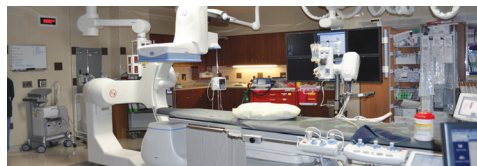
Procedure room at the John “Tito” Francona Heart & Vascular Center