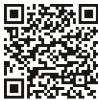
Download for Android