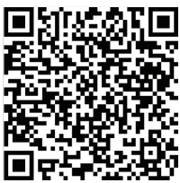
Download for iPhone

Android - scan the QR code below or go to: https://play.google.com/store/apps/details?id=org.hvhs.android.hvhs