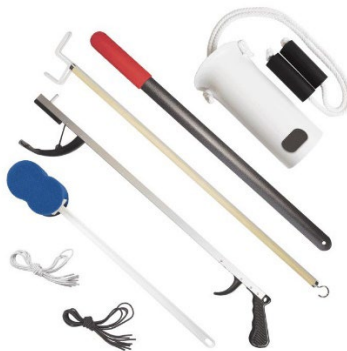
Hip Dressing Kit

Can be provided during hospital stay. A bill for $39.99 will be sent to your home.