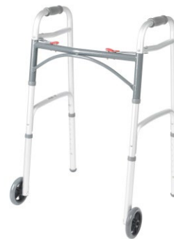
Front Wheeled Walker

Can be provided during hospital stay. A bill for $39.99 will be sent to your home.