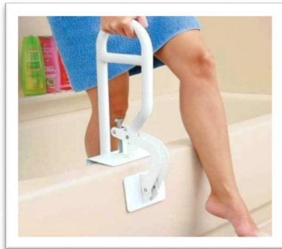
Bathtub Grab Bar Attachment