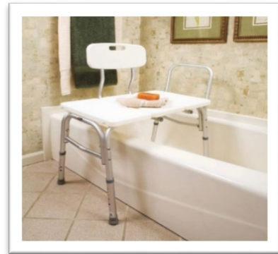
Tub Transfer Bench