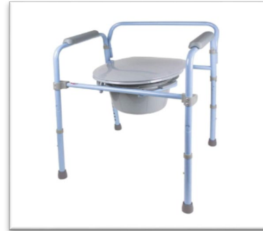
Elevated Toilet Seats/Bedside Commode ❖ Necessary for Total Hip Replacements